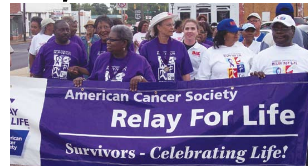
Relay for Life Cancer Survivors Circle takes the first lap of the event.

This year, UBT supported the American Cancer Society Annual "Relay for Life Walk" as the title sponsor. The event was held on Friday, April 27 th , 2007, in downtown Tuskegee.